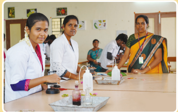
SRI KALISWARI COLLEGE